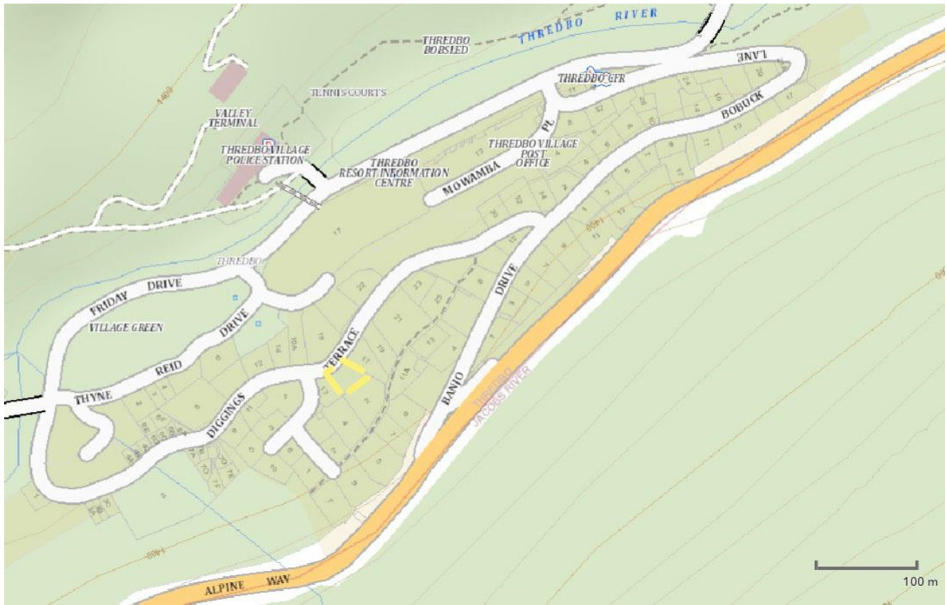
Figure 2: Locality Plan