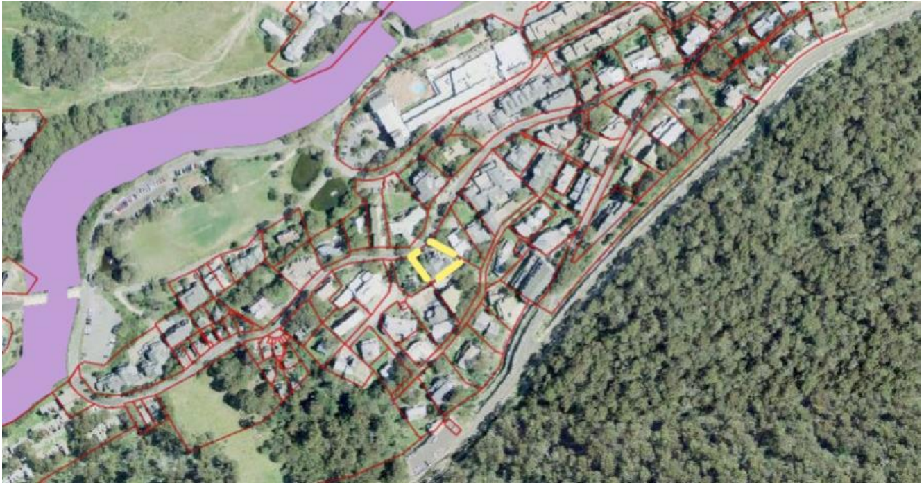
Figure 4: Extract from the Biodiversity Values Map