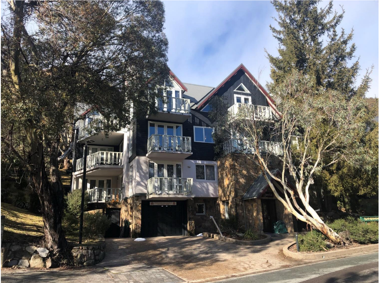
Figure 3: Street Elevation Existing